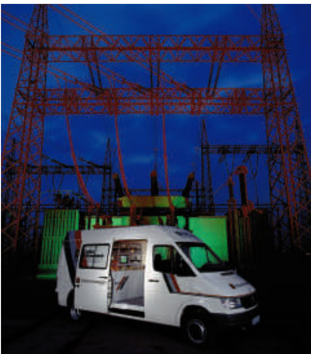
Test Van in Action